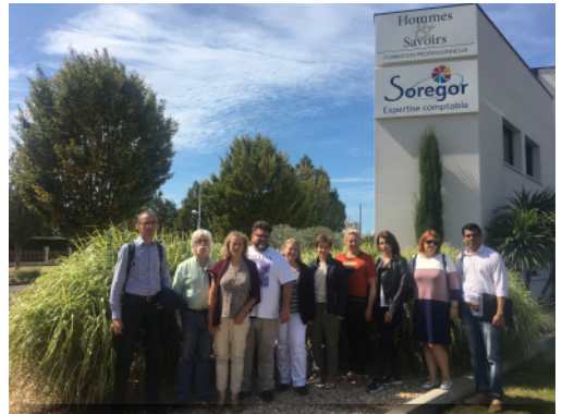
Hommes & Savoirs (FR) was the host organization

In addition, representatives of partner organizations discussed the produced Specification of the Curriculum and Course Syllabus for the Office ECO Consultant Training System. Timetable, milestones and deadlines were also reviewed.